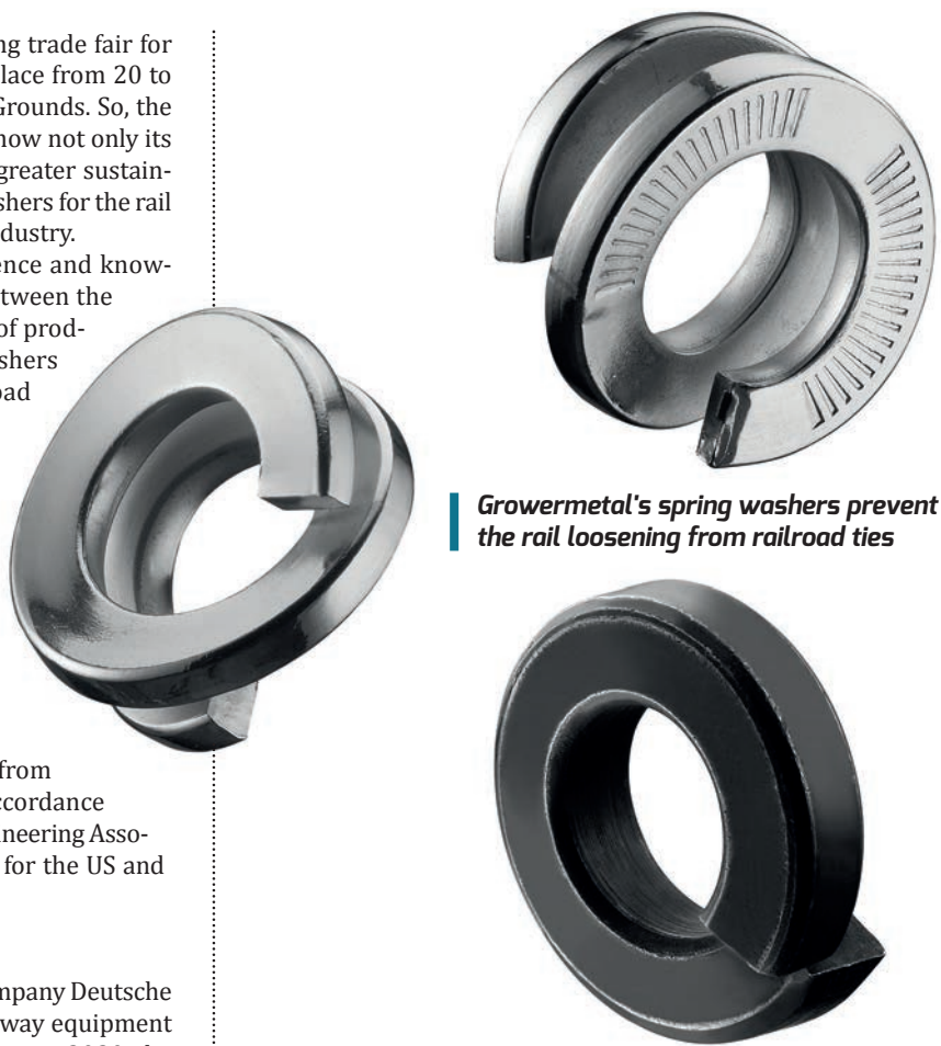
Growermetal's spring washers prevent the rail loosening from railroad ties