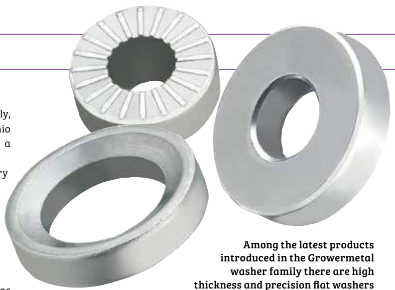
Among the latest products introduced in the Growermetal washer family there are high thickness and precision flat washers

and contraction with the elimination of play, conical elastic washers are able to prevent loosening of assemblies. Designed to accommodate static loads, these products are ideal for applications requiring low vibration resistance and parts supporting temperature variation.